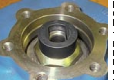
Figure 1 Pulley hub with coupler in place on shaft