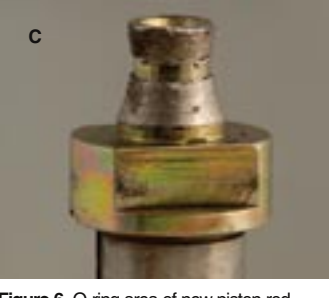
Figure 6 O-ring area of new piston rod (Figure A), minor damage at rear of piston rod showing scuffed plating serviceable with repair kit (Figure B), and severe damage to rear of piston rod showing worn-away metal, not serviceable. (Figure C)