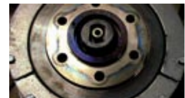
Figure 5 Dark streaks from overheating

clutch may also be blued along with other surfaces and components. The front face of the clutch may have dark streaks radiating outwards from the access hole area. (Figure 5) These deposits are caused by an overheated lining. Dark dusty deposits on the inside of the clutch housing also indicate overheating.