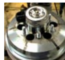
Figure 4 Bluing effect

If the coupler is rounded out, the clutch ball bearings need to be inspected carefully. The clutch should be replaced if bearings are damaged or worn.