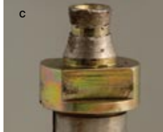
Figure 6 O-ring area of new piston rod (Figure A), minor damage at rear of piston rod showing scuffed plating serviceable with repair kit (Figure B), and severe damage to rear of piston rod showing worn-away metal, not serviceable. (Figure C)