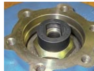
Figure 1 Pulley hub with coupler in place on shaft