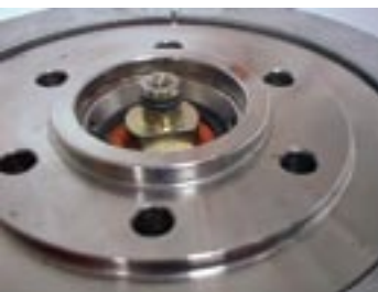
Figure 2 Clutch with rear O-ring on piston rod

There is no load on the coupler during clutch operation. The coupler simply keeps the clutch piston rod (center shaft) from turning. It couples the piston rod to the shaft of the pulley hub by engaging both the flats of piston rod and the pulley hub shaft. The O-ring on the rear of the piston rod is the air seal between the clutch and pulley hub. (Figure 2)